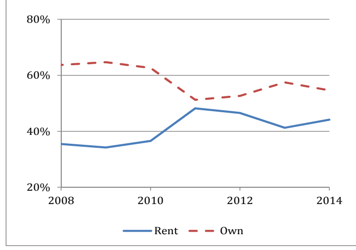
Fig. 1: Pennsylvanians Aged 20-30, Share of Owners Versus Renters

Recent inflation data confirm that the economic outlook for renters in Pennsylvania may be deteriorating. Figure 2 displays the growth rate for the Philadelphia met-